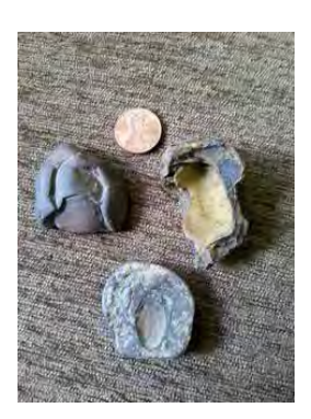
Samples of small rock concretions found at Hells Hollow State Park replacement body. in Pennsylvania.

A concretion is a hard, compact mass of matter formed by the precipitation of mineral cement within the spaces between particles, and is found in sedimentary rock or soil. Concretions are often ovoid or spherical in shape, although irregular shapes also occur. The word 'concretion' is derived from the Latin con meaning 'together' and crescere meaning 'to grow'. Concretions form within layers of sedimentary strata that have already been deposited. They usually form early in the burial history of the sediment, before the rest of the sediment is hardened into rock. This concretionary cement often makes the concretion harder and more resistant to weathering than the host stratum.