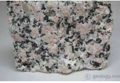
Photograph of a granite with very large crystals of orthoclase feldspar. Granites with such large crystals are known as "pegmatites". This rock is about two inches across.

and thin and heavy, while granite is light and accumulates into continent-sized rafts which bob about like corks in this "sea of basalt." When a continent runs into a piece of seafloor, it's much like a Mac truck running into a Volkswagen. Not very pretty, but at least there's a clear winner. And the seafloor basalt ends up in pretty much the same position as does the VW - under the truck (or continent, as the case may be). This gives it the heat it needs to re-melt and try to complete the differentiation process which was so rudely interrupted at the spreading ridge. If successful and allowed to continue, what's left behind is a "purified" magma with most of the iron, magnesium, and other heavy elements removed. When it cools, guess what forms? And the continental land mass just got a wee bit larger.